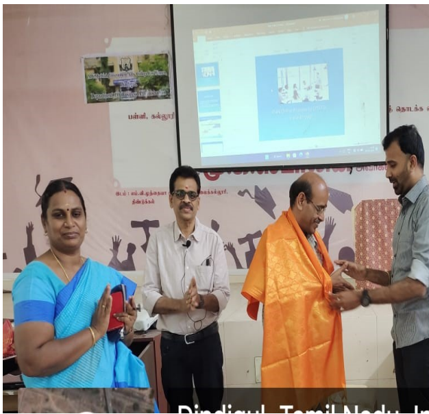
Disciplined Tamil Nadu