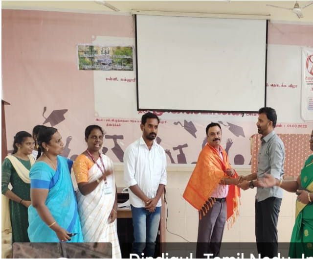
Disciplined Tamil Nadu