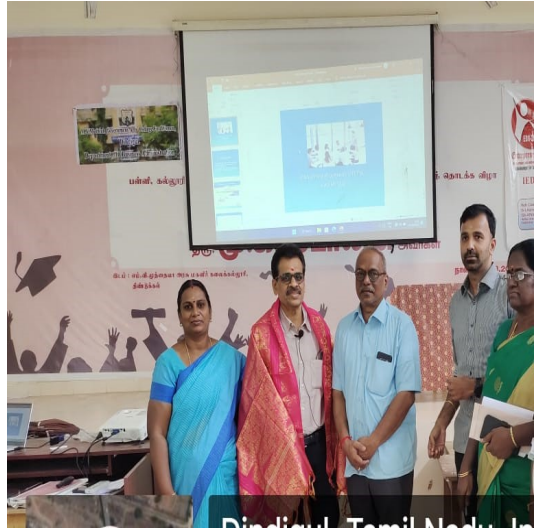
Disciplined Tamil Nadu