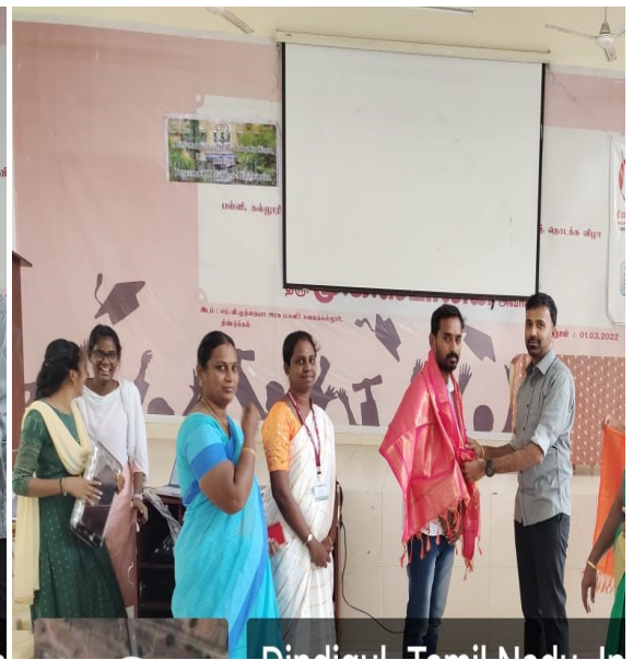
Disciplined Tamil Nadu